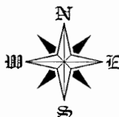
Exhibit B Resolution 628-10 Lansdowne Oaks, Block B